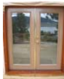
30" French Doors