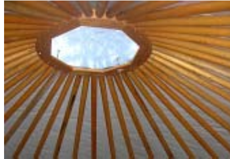
Lodgepole Pine Rafters - hand sanded and stained

Additional Doors — Additional doors, in any style, can be added to your yurt. Using a clock face, doors must be placed at 3:00, 6:00, 9:00 and 12:00 o'clock locations. All doors come with the highest quality hardware and lockset with extra keys.