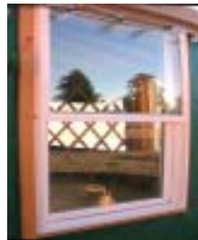
Sliding glass windows