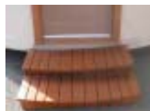
Steps for all sizes