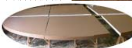
Sectional insulated floor

Door Upgrades — Door options include a steel door with an opening, shatter-proof glass window and screen, French doors, either 24" or 30"h, and colours of choice.