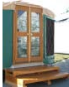
24" French Doors