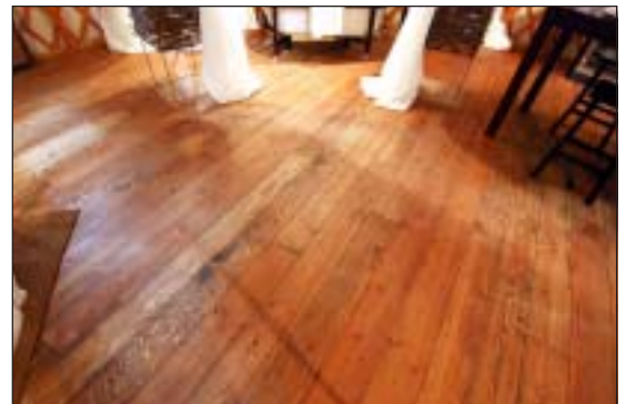
Photo shows a gorgeous fir floor.

Laminate is a popular flooring which is economical, looks terrific and can be installed in one day. It is hard wearing and blends beautifully with the wood lattice work and rafters in the yurt.