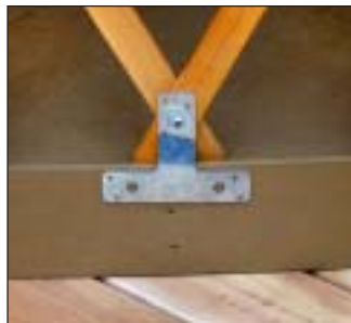
An insulated floor sitting on a wooden deck