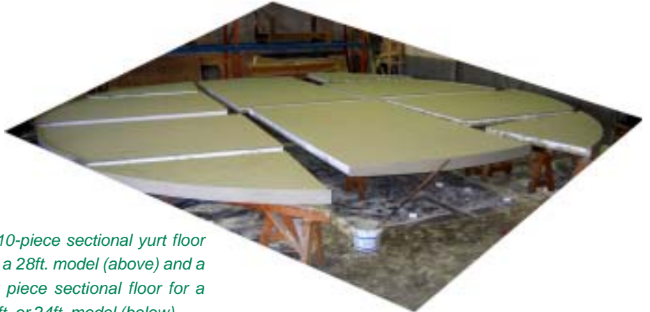
A 10-piece sectional yurt floor for a 28ft. model (above) and a six piece sectional floor for a 20ft. or 24ft. model (below).

■ Quality painted finish; ideal for those who plan to install another floor covering over top, such as vinyl, parquet or carpet.