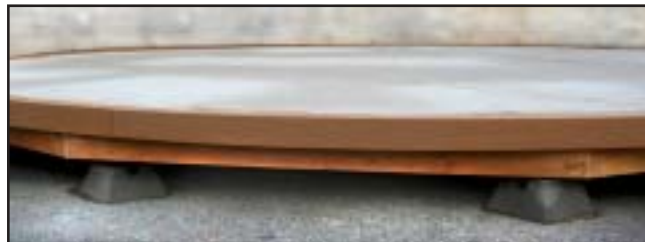
An insulated deck sitting on the foundation, waiting for a yurt to be installed.